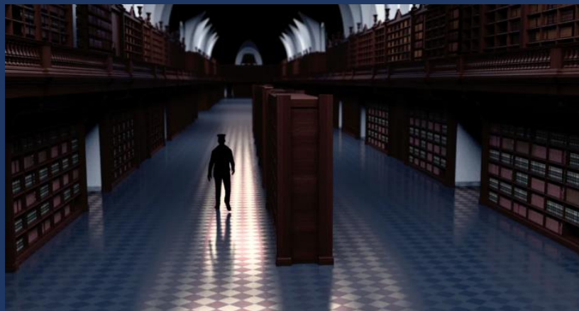
THE HIDDEN BY VISIBLE FICTIONS

FOLLOWED BY LATE AFTERNOON PERFORMANCE OF THE HIDDEN BY VISIBLE FICTIONS