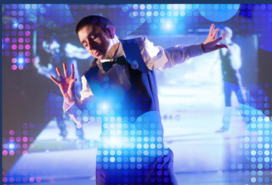
THE DANCER – 21COMMON

FOLLOWED BY LATE AFTERNOON AND EVENING PERFORMANCES OF HIDDEN BY VISIBLE FICTIONS , AND FILMS BY 21COMMON