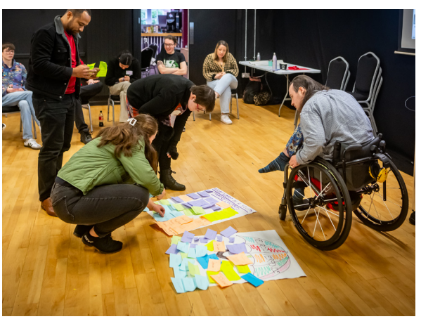
(Photo: @ Andy Catlin • Emergence Edinburgh Nov 2019 | Dumfries Hub Nov 2023)